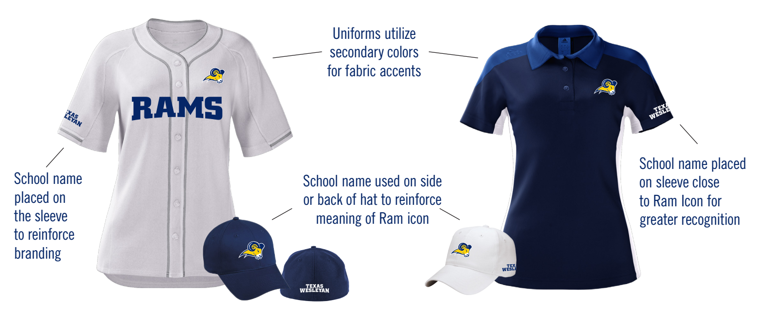
ALL logo use must be approved by the Office of Marketing & Communications before production.