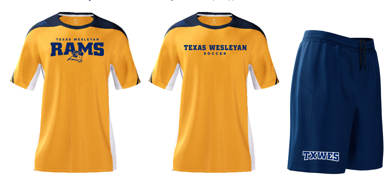
ALL logo use must be approved by the Office of Marketing & Communications before production.