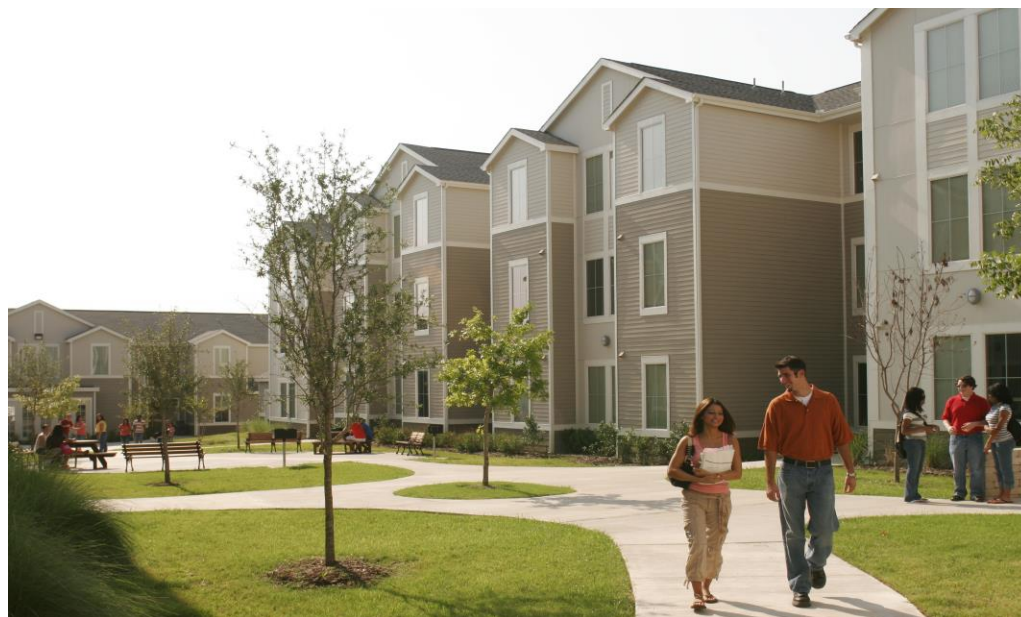
West Village on the campus of Texas Wesleyan University